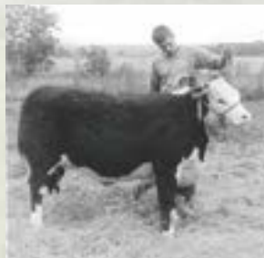
1967 Grand Champion Heifer, Fond du Lac County Fair