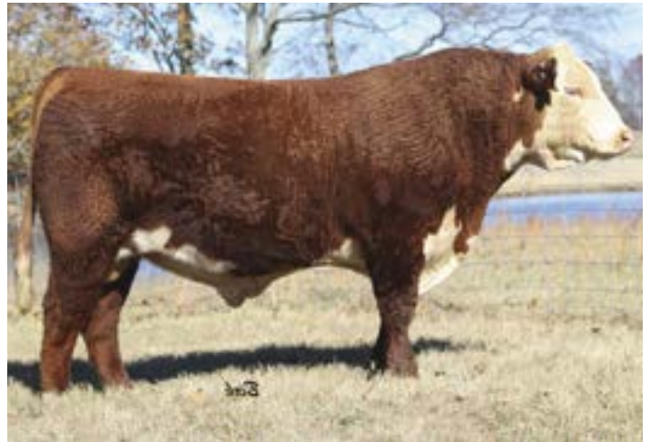
JW 1857 MERIT 21134