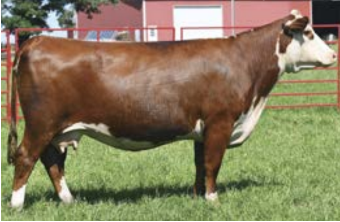
HUTH D080 MANDY H001 Daughter of Lot 68...sells as Lot 4