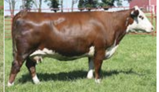
HUTH T002 COLLEEN F010 Dam of Lot 133...sells as Lot 98