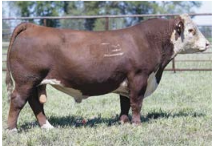
RST FINAL PRINT 0016