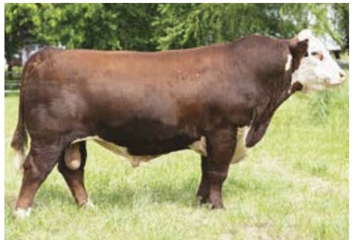
BIRDWELL VANGUARD 5022 9337