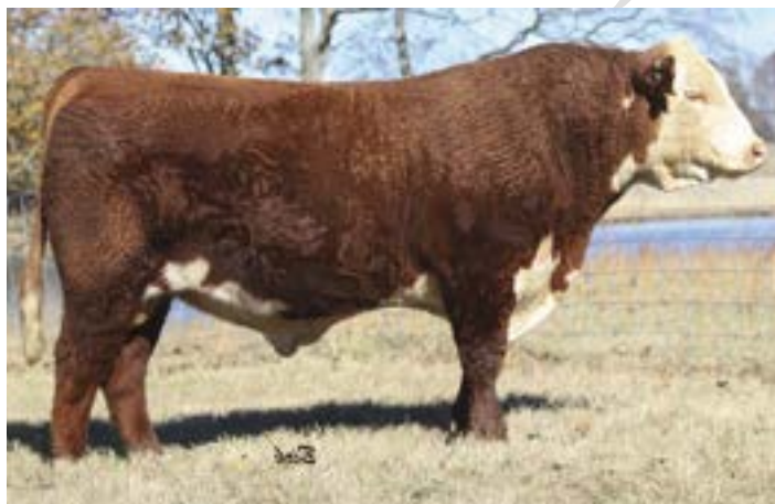
JW 1857 MERIT 21134