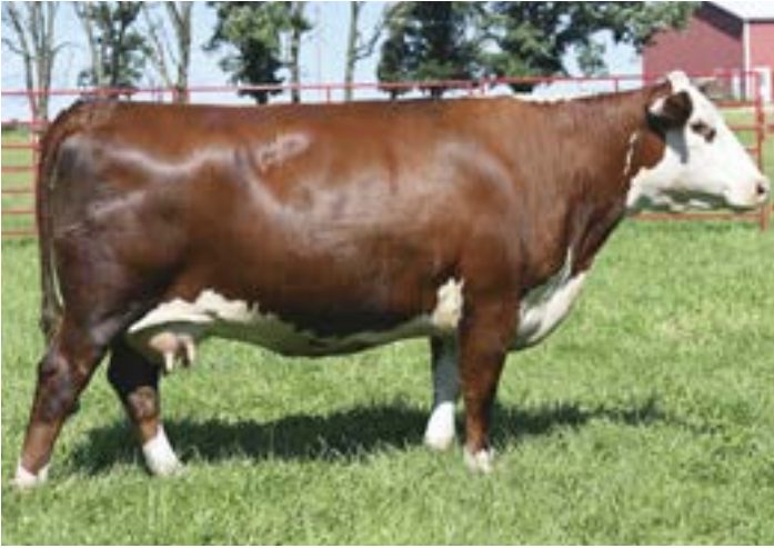
HUTH T002 COLLEEN F010 Dam of Lot 104...sells as Lot 98