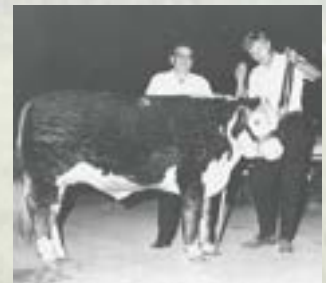
1969 Grand Champion Steer, Fond du Lac County Fair