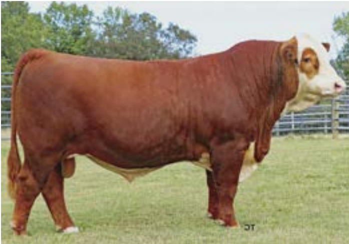
HUTH CLC WF DELUXE K016