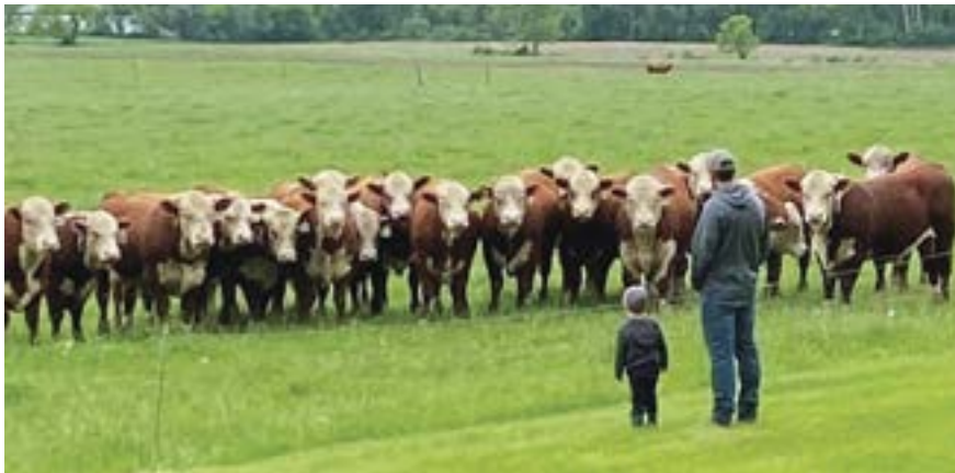
Our 2024 sale bulls