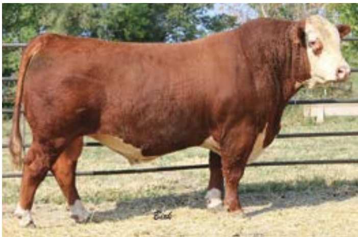
HUTH FTF TORQUE C002 Sire of Lot 6...10 daughters of this Sire of Distinction sell