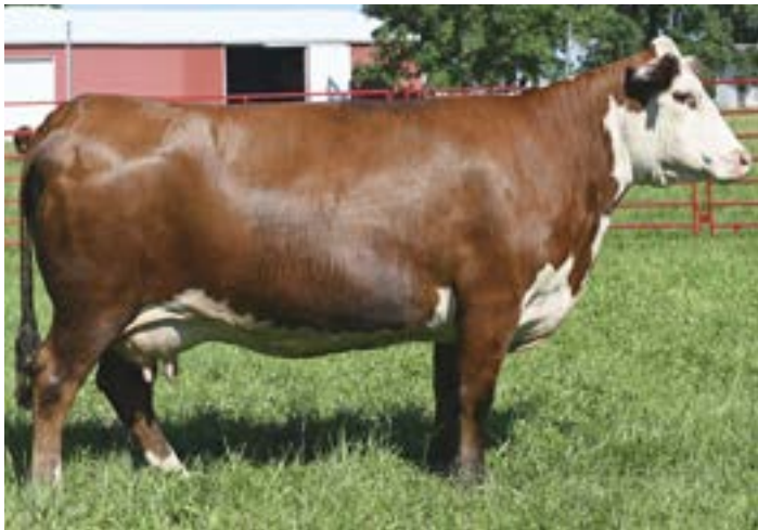
HUTH Z024 MS EXEDE F035 Dam of Lot 139...sells as Lot 3