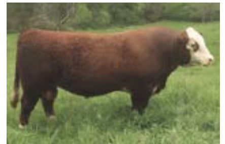
Huth FTF Torque C002, pictured at partner Falling Timber Farms. His daughters sell.