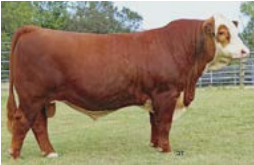
HUTH CLC WF DELUXE K016