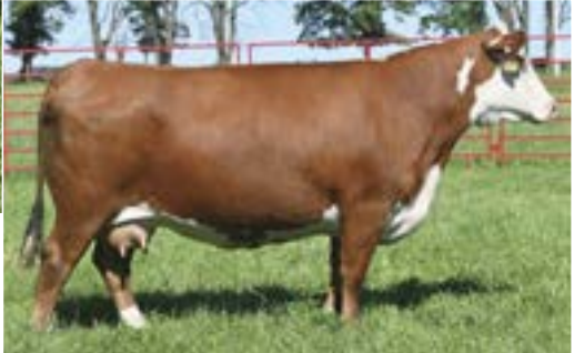
HUTH F035 MANDY H029 Maternal sister to Lot 72...sells as Lot 2