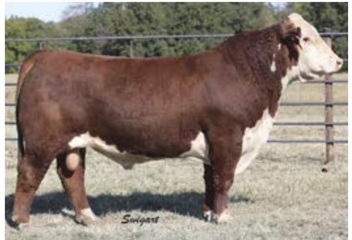
GO KING E33 Sire of seven of the spring calves selling