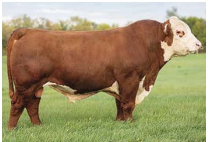
RV VALOR 9444G ET