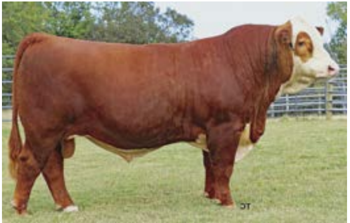
HUTH CLC WF DELUXE K016

Full brother to Lot 2A ...his first calves & his service sell