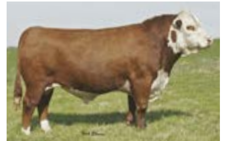
Huth Oak P017, A.I. sire sold to Accelerated Genetics