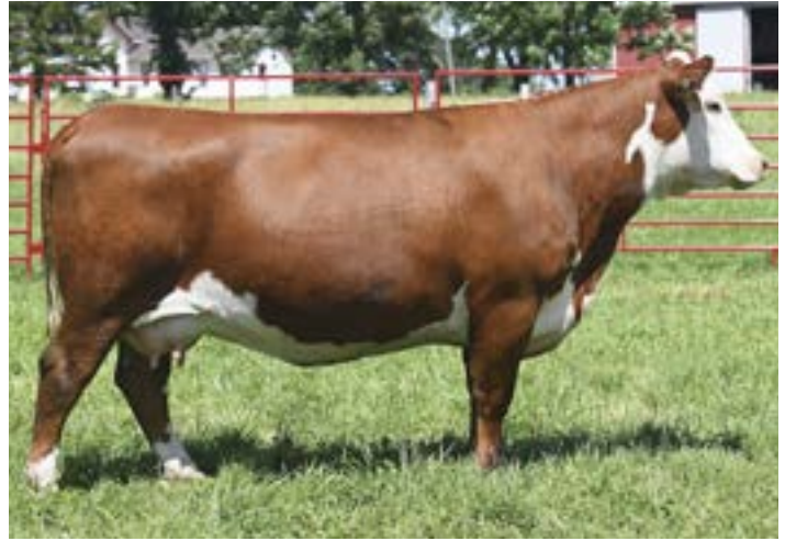
HUTH A039 COLLEEN H051 Dam of Lot 105...sells as Lot 57