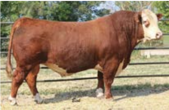
HUTH FTF TORQUE C002 Maternal brother to Lot 95 ...10 daughters sell