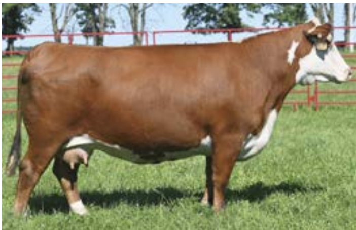
HUTH F035 MANDY H029 Daughter of Lot 3...sells as Lot 2