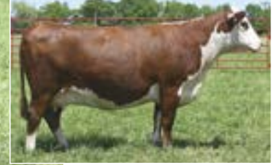
HUTH E064 COLLEEN H017 Dam of Lot 26...sells as Lot 6