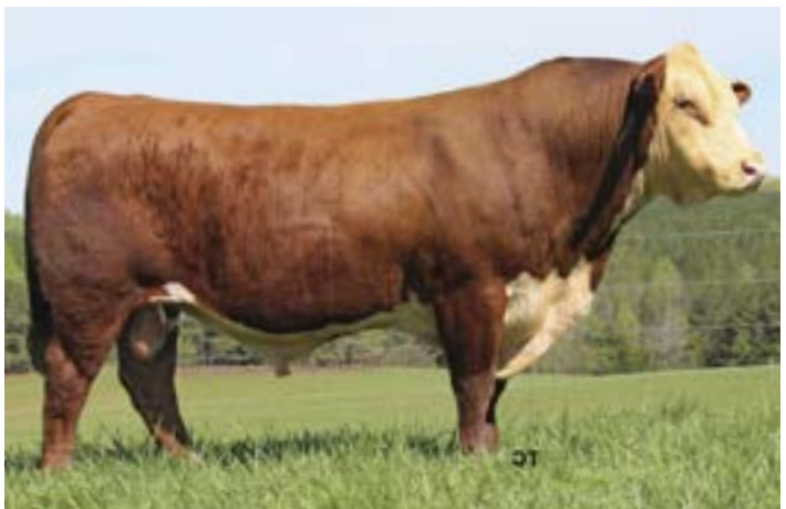
KCF BENNETT TRUST B279 ET Sire of Lot 7A