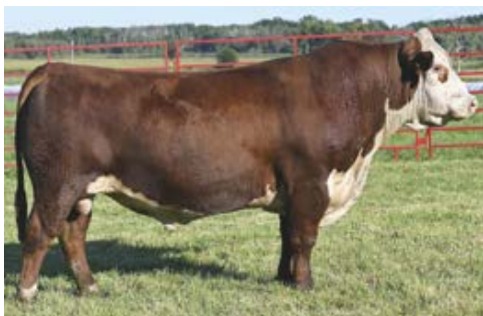
HUTH C049 ADVANCE F083 J006 Herd sire son of Lot 7... sells as Lot 8