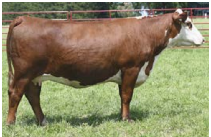
HUTH H017 DESTINI K052

Maternal sister to Lot 6A...sells as Lot 26