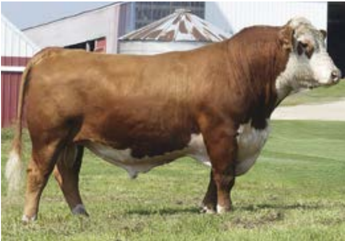
HUTH LHF BADGER K021