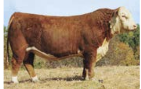
INNISFAIL WHR X651/723 4013 ET Sire of Lots 85 & 86