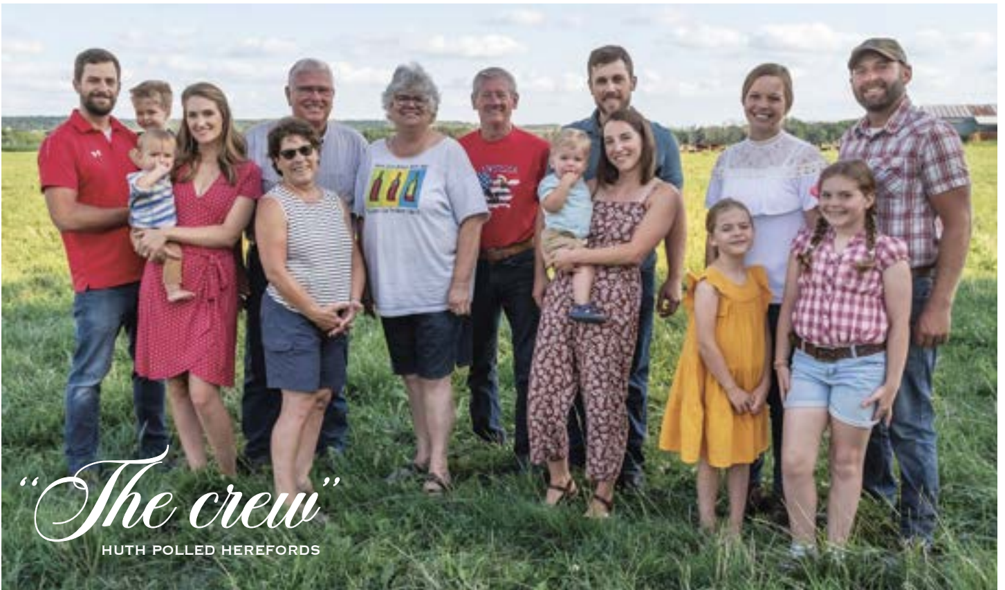
"The crew" HUTH POLLED HEREFORDS