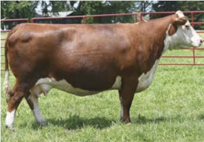
HUTH X903 MISS FOREMOST C049 Dam of Lot 135...sells as Lot 7