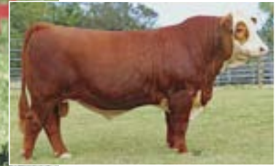
HUTH CLC WF DELUXE K016 Sire of Lot 70A