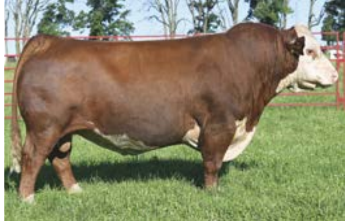
H B DISTINCT 115 progeny & the service of this Homozygous Polled CHB sire sell ...be sells as Lot 1