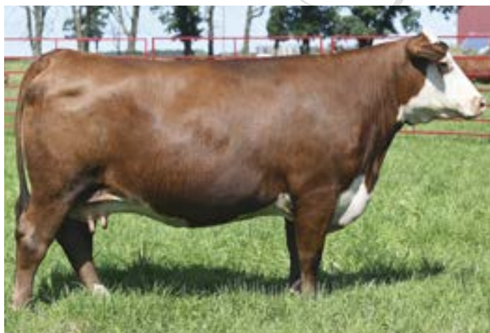
HUTH E062 MS TORQUE F050 H101 Dam of Lot 122...sells as Lot 87