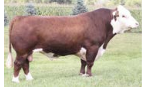
EFBEEF X651 TESTED A250 Sire of Lots 90 & 91