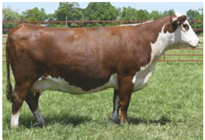
HUTH E064 COLLEEN H017 Dam of Lot 137...sells as Lot 6