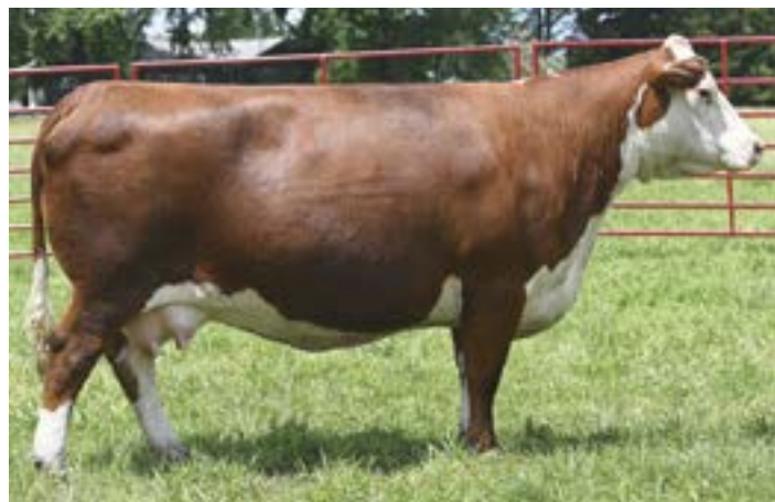
HUTH X903 MISS FOREMOST C049 Dam of Lot 8...sells as Lot 7

The progeny and pasture service of Lot 8 sell.