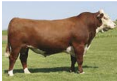
Huth Prospector K085, A.I. sire sold to Accelerated Genetics