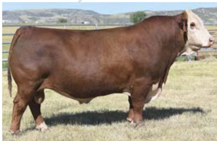
CMF ERNST POWER BROKER 405F

Sire of Lot 27A... five progeny of this CHB sire sell