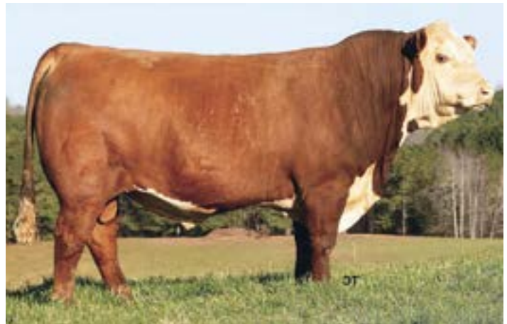
KCF BENNETT MONUMENT J338 Sire of Lot 3A