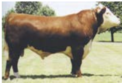
Huth Enhancer 2D, one of the all-time highest Hereford semen sellers for ABS